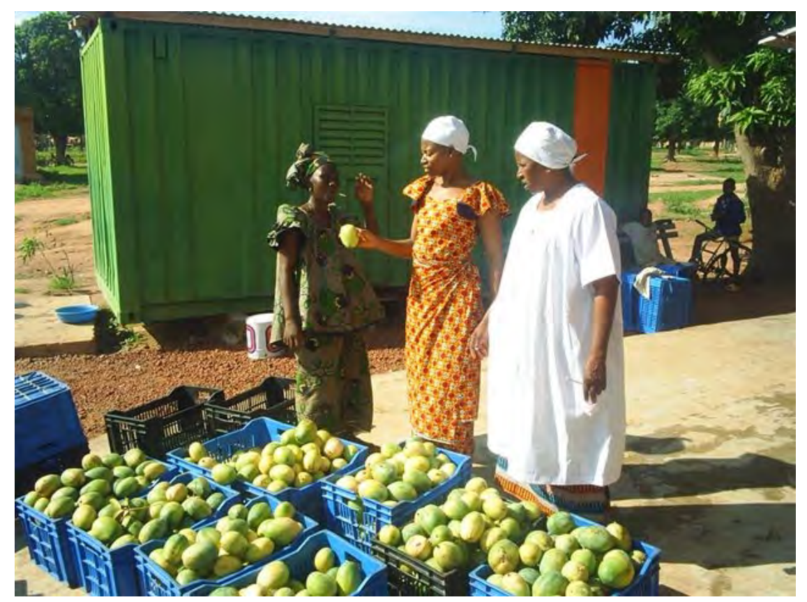
Quality control by women working in the processing of organic mangos for Burkinature in Burkina Faso