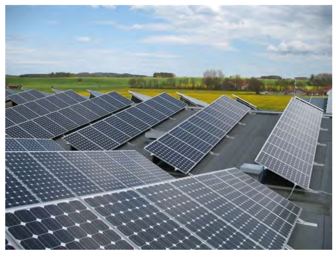
Solar energy from the Rapunzel roofs

3.3.4 Rapunzel Naturkost guarantees physical traceability of the HAND IN HAND products. Exceptions may be made if due to specific requirements in the production process physical traceability is not possible or unreasonably difficult to realize. These special cases shall be clearly identified by Rapunzel Naturkost. In these cases, the mass balance system is applied.