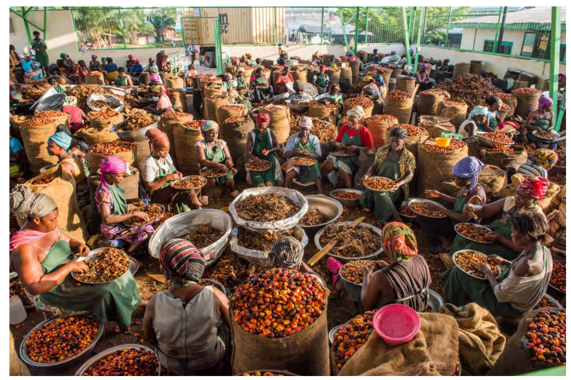
HAND IN HAND partner Serendipalm in Ghana: An exemplary women's project for the production of fair and organic palm oil