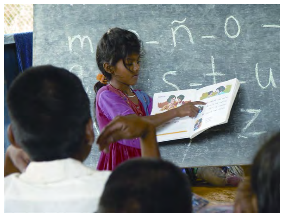
Children must have the possibility to go to school: Rainforest school Patuca, Honduras