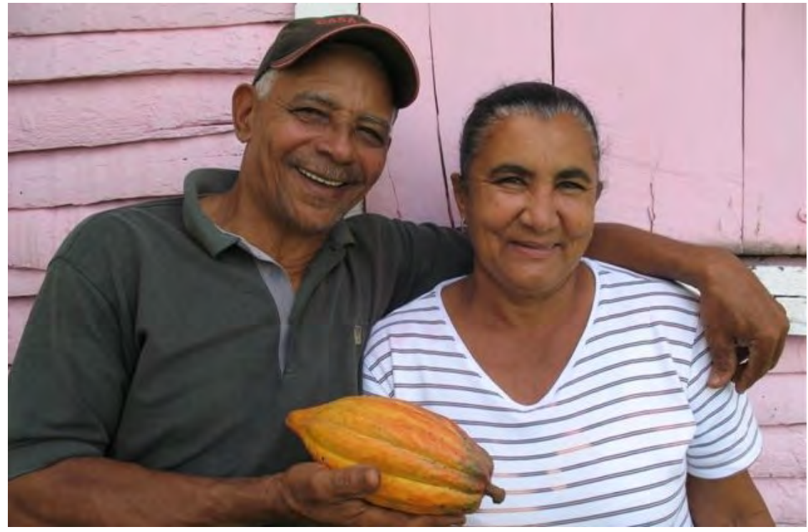
HAND IN HAND and organic: Cocoa farmers in the Dominican Republic