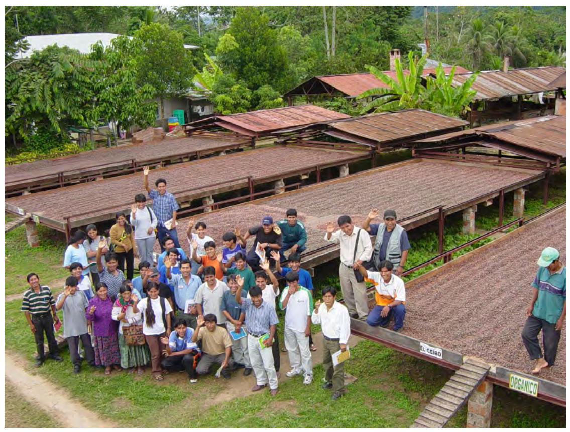
El Ceibo, Bolivia: Members of the cocoa cooperative

Farmer cooperatives / associations and farmers employing (seasonal) workers must comply with the minimum criteria for enterprises with permanent and/or seasonal employees / workers set out in 4.4