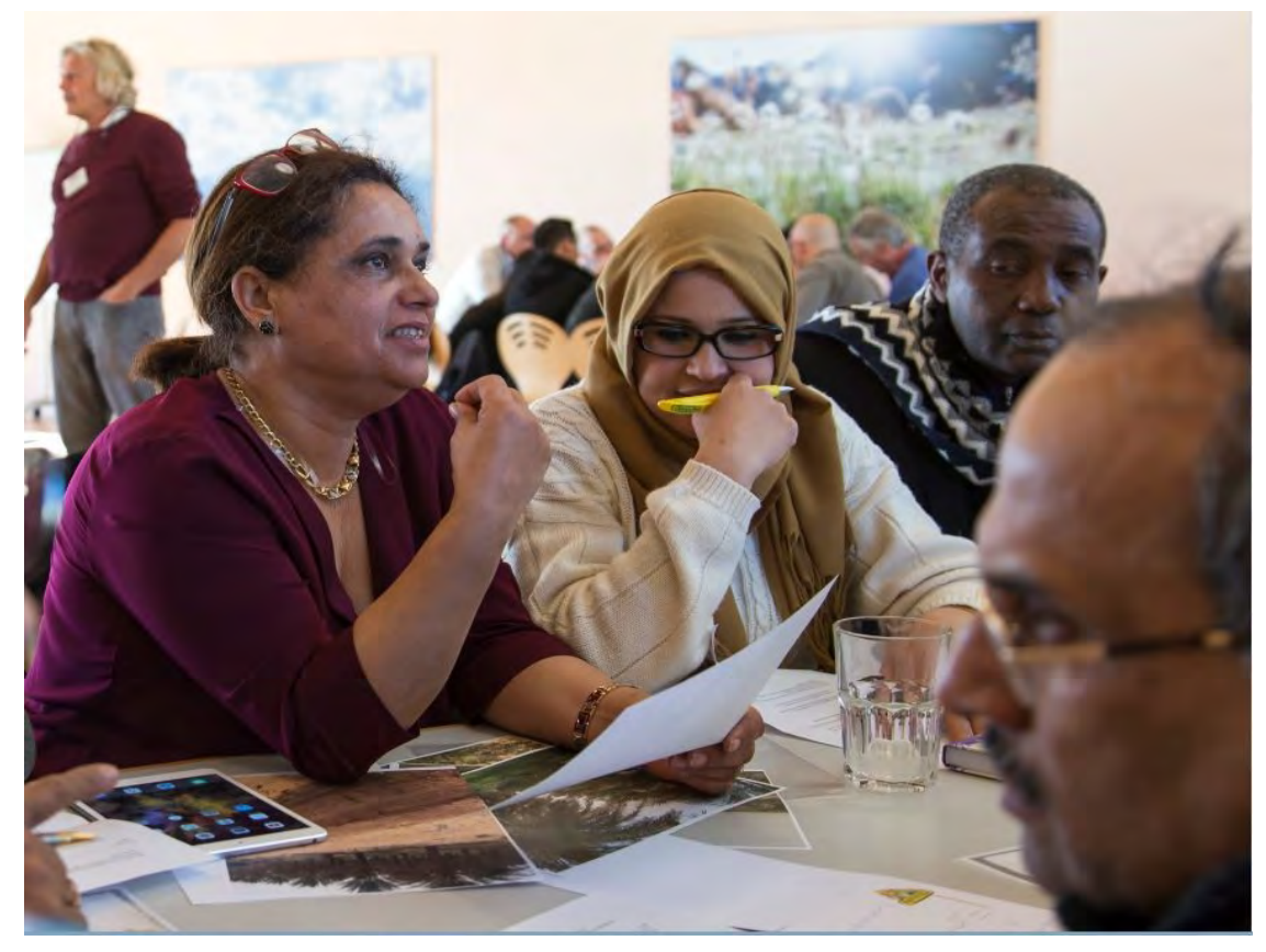
HAND IN HAND workshop at Rapunzel: Regular meeting point and opportunity for interesting exchange for the HAND IN HAND partners from all over the world