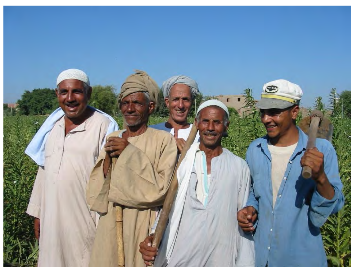
Organic and HAND IN HAND: Sesame farmers and farm workers of LOTUS / SEKEM in Egypt

(For criteria applicable to Rapunzel Naturkost please see 3.11)